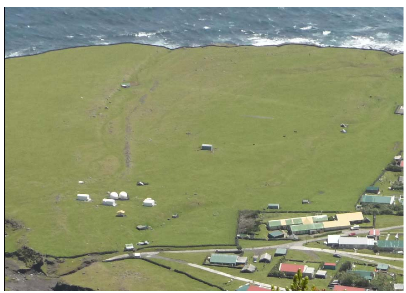
Figure 1. View from the South with the Tristan da Cunha absolute hut (centre). The edge of the gulch is shown on the left side in the foreground. Between the gulch and the absolute hut is the CTBTO monitoring station (approximately 140 meters from the absolute hut) and the settlement is to the east (approximately 110 meters). The variometer shelter was not yet established at that time.

The island is volcanic with strongly magnetised rocks, and the geomagnetic observatory was placed on the coastal plain with a smooth (and rather flat surface) to avoid magnetic gradients. The plain consists of horizontal lava flows overlain by volcanic sediments and soil. The remnant magnetisation of the volcanic material in the soil and sediment likely cancels out, so the magnetisation below the observatory should be mainly induced magnetisation. The location on the golf course was chosen to have maximum distance to the settlement, to the coast, and to a nearby gulch which carries volcanic gravel and boulders, see Figure 1. The coast and gulch were avoided because their topography could give rise to magnetic gradients and because erosion processes will move the magnetic volcanic material and thus change the local magnetic field bias. A preliminary total field survey of the area showed that the planned location had relatively small gradients compared to the area closer to the coast.