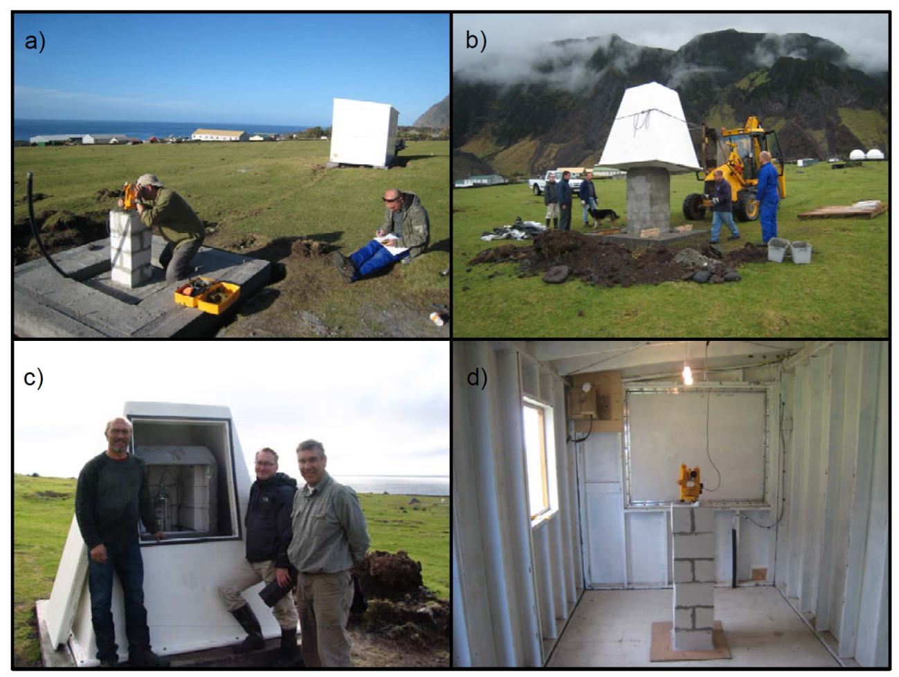
Figure 2. (a) Foundation of the variometer shelter with variometer pillar (left) and absolute hut (right) seen from west during sun observation on variometer pillar. (b) Mortar covered aerated concrete structure to be covered by pyramid-shaped fibreglass shelter for wind and rain protection. (c) Fibreglass shelter with open access door shows aerated concrete structure with open access window and variometer sensor. (d) View inside the absolute hut from east: DI-flux on pillar, window towards south, removable panel in wall towards west, and scalar magnetometer in the upper south-west corner.

For further protection against rain and wind, the aerated concrete structure is covered with a fibreglass shelter (Figures 2b and c) that is attached to the outer foundation (shown in Figure 2a). The shelter is pyramid-shaped (with a flat top) to withstand strong winds without the need for stay wires. The fibreglass shelter was prebuilt in South Africa (designed by DW). A wooden frame was constructed resembling a pyramid with flat roof. The frame was covered both inside and outside with plywood and the gaps in between filled with Isotherm (a polyester fleece) and painted inside. On the outside, the plywood was covered with four layers of lightweight fibreglass (chopped-strand mat), polyester-resin and finished with self-levelling polyester-resin mixed with white pigment for UV-protection and a high albedo (sunlight-reflection) for temperature stability.